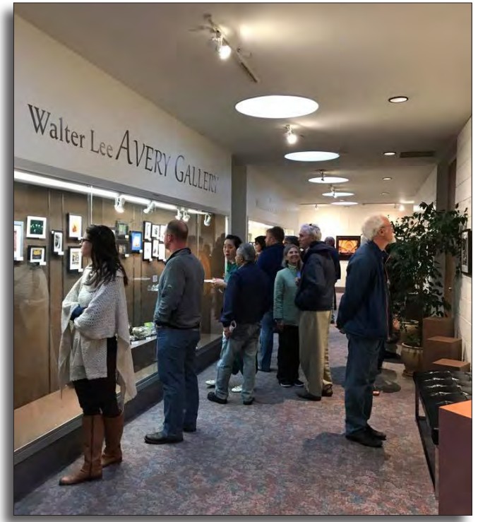
Reception guests in the gallery entry hall.