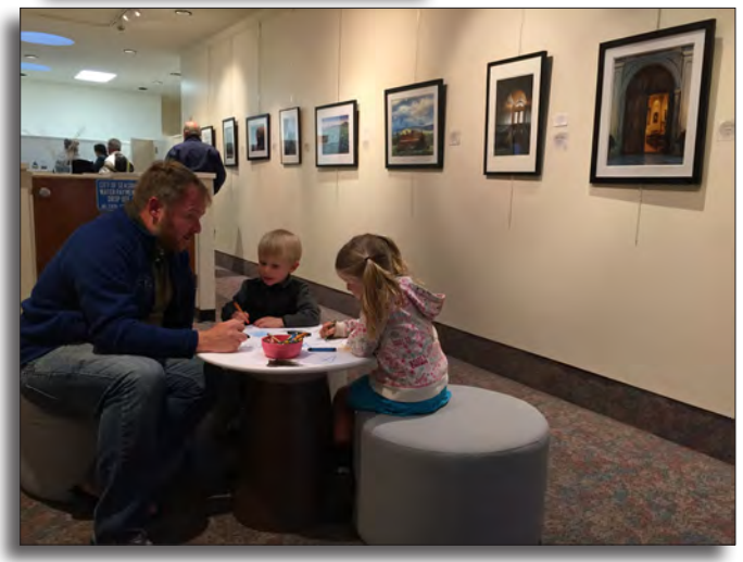
A Dad and his children share a creative moment...